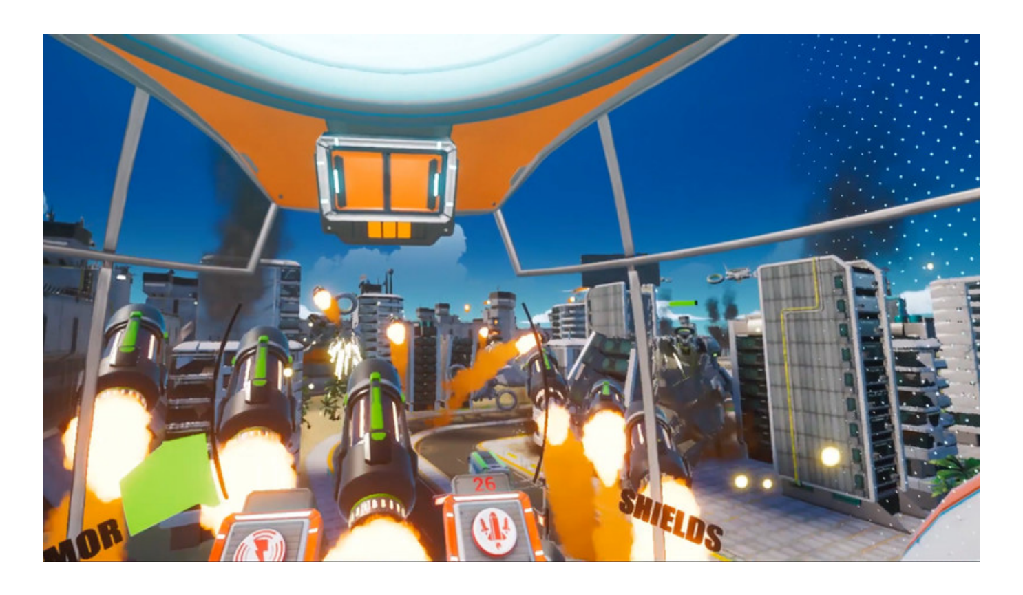
The IOTA Project Activation Code [Ativador]

Download ->>->> <a href="http://bit.ly/2NMcA8d">http://bit.ly/2NMcA8d</a>